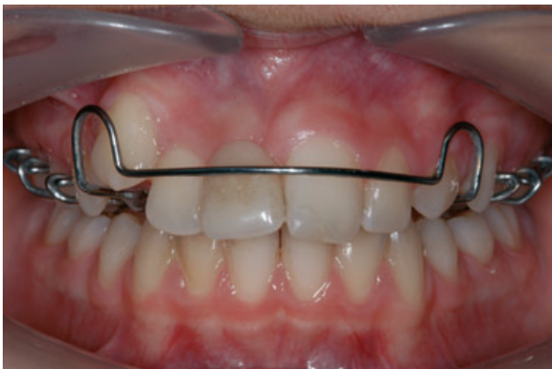
Fig. 3. Traditional care of space is accomplished by means of a modified orthodontic retaining plate and a plastic prosthetic tooth in region 11.

bone ensures stability even during mixed dentition. The risk of implant fracture is to the lever effect of the wire extension (stainless steel 1.2 mm; laser-welded; Fig. 5b), is minimized by the elasticity of the palatal vault (6). Moreover, this denture can be fitted to the vertical growth of the alveolar process at any time by grinding the plastic base. Owing to its small surface and accessibility, it is easy for patients to clean. Further advantages are its wearing comfort, esthetics (Fig. 5c) and phonetics. Additionally, the denture presented here can be used for maximum orthodontic anchorage to correct malocclusion.