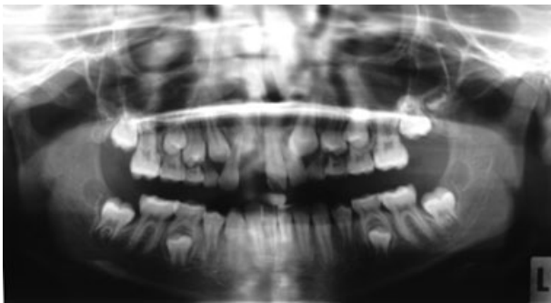
Fig. 2. The orthopantomogram shows the loss of tooth 11.