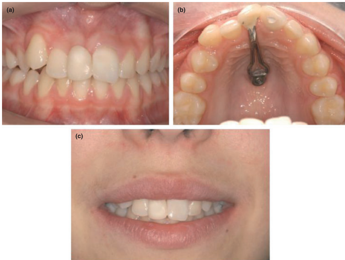
Fig. 5. Photographic findings intraoral (a, b) and extraoral (c) with the new type integrated temporary prosthetic substitution by means of a palatal implant.

on the bridge parts. Furthermore, adhesive bridges are contraindicated in teeth with a short clinical crown, which signifies a smaller adhesive surface, as well as in teeth with marked abrasions and a small enamel surface. Especially when, a growing patient requires orthodontic treatment later because of misalignment of teeth, the adhesive bridge fails to serve its purpose as a provisional measure. In such cases – as in our patient – extensive orthodontic tooth movements are rendered difficult or cannot be performed in the desired manner. Hence, this alternative should be considered when orthodontic tooth movements have been completed.